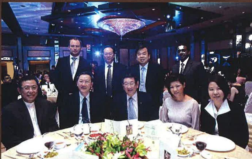
THE INAUGURAL SINGAPORE SUSTAINABILITY AWARDS 2010 RECOGNISES LOCAL COMPANIES WITH TOP SUSTAINABLE AND GREEN BUSINESS PRACTICES.

Seven local companies awarded for their sustainability and green solutions in the inaugural Singapore Sustainability Awards 2010.